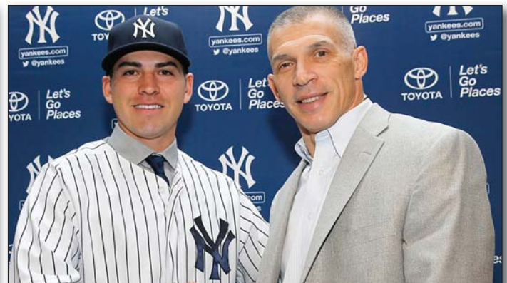
Jacoby Ellsbury signed with the New York Yankees prior to 2014